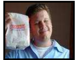
A DONUT DROP!

IN THE STREETS... On Friday, October 31st, LIFEQuest hosted a Movie Night in the Cumberland Subdivision featuring "It's The Great Pumpkin, Charlie Brown." Along with a movie, we handed out lots of candy and popcorn to the trick or treaters.